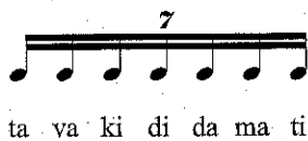
Figure 3. Takadimi Syllables for Irregular Divisions

tem. The discontinuous transition from Kodály syllables to counting becomes unnecessary. Effective elementary music instruction in the Takadimi syllables could virtually eliminate the need to focus on rhythm reading during the crucial first stages of instrumental instruction, freeing valuable time to focus on playing and skills.